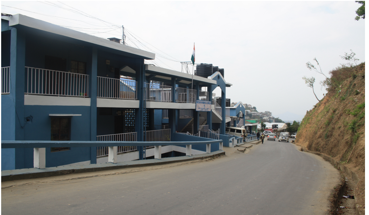
Mizoram Information Commission Building.