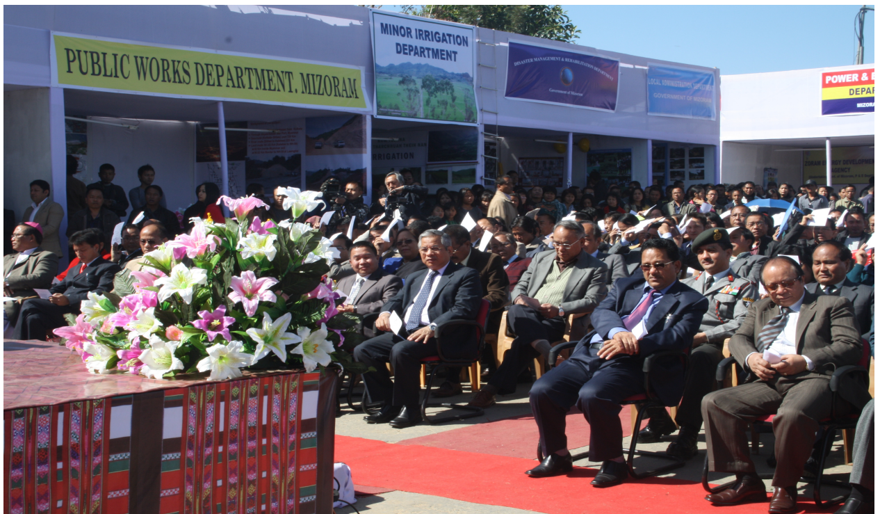
25 Years peace in Mizoram celebration – cum – exhibition from 25 th – 28 th January 2012 at new Secretariat Complex Ground where Mizoram Information Commission participated by making a stall for disseminating information on RTI